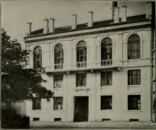
LATTER-DAY SAINTS' MISSION HOUSE, CHRISTIANIA, NORWAY.